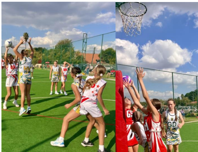
U'13 A & B