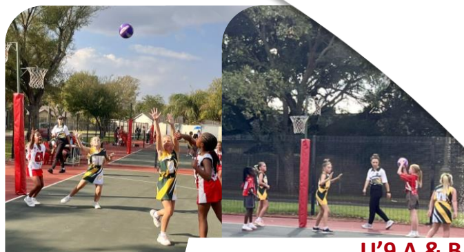
U'9 A & B

We thank all the girls and their coaches for their commitment and passion throughout the season.