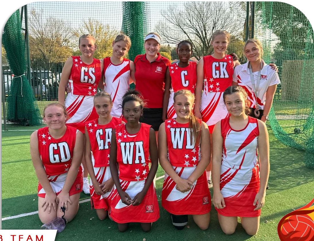
U'13 B TEAM

"Champions keep playing until they get it right" – Billie Jean King