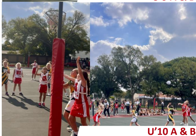
U'10 A & B