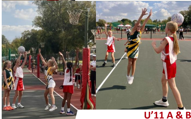
U'11 A & B