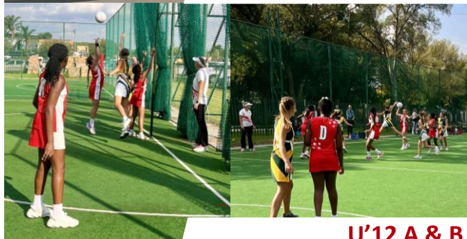
U'12 A & B