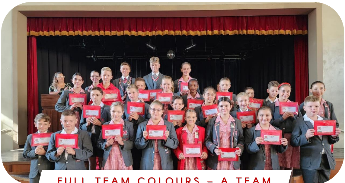
FULL TEAM COLOURS - A TEAM