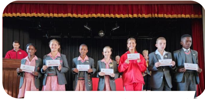
HALF COLOURS AWARDS