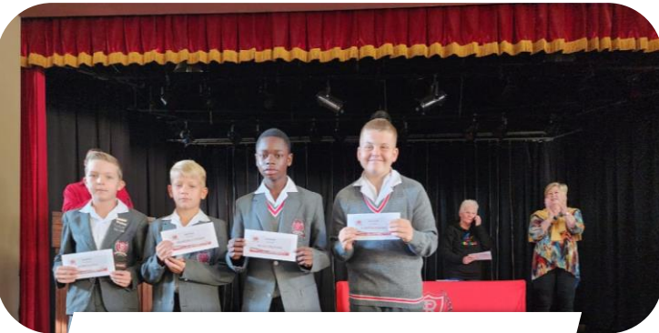
FULL COLOURS AWARDS