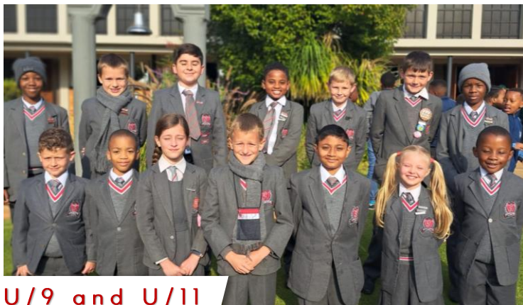
U/9 and U/11