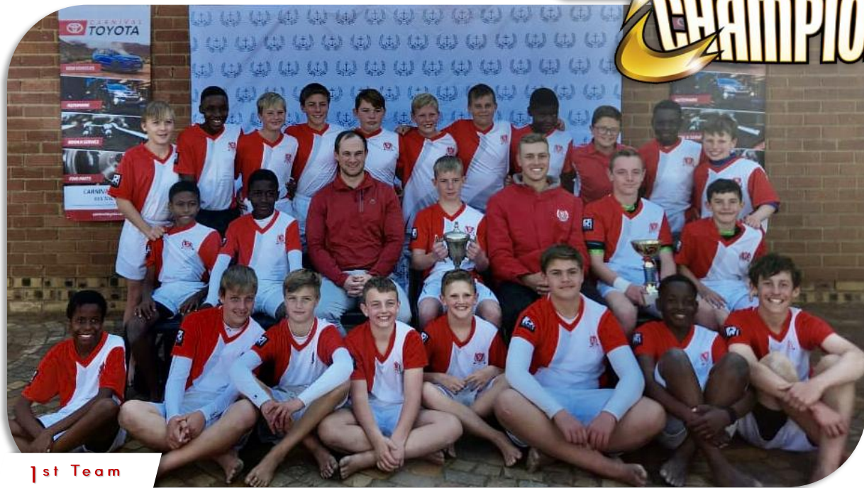
1 st Team