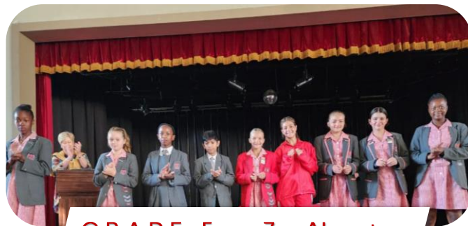
GRADE 5 – 7: Absentees

“Success is not final, failure is not fatal; it is the courage to continue that counts”